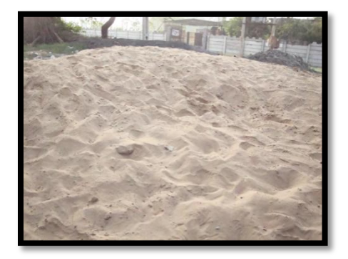
Fig 4: Kheda dust

Kheda dust is a onetype of the fine sand. In the manufacturing of the brick Kheda dust is used for making finished bricks.